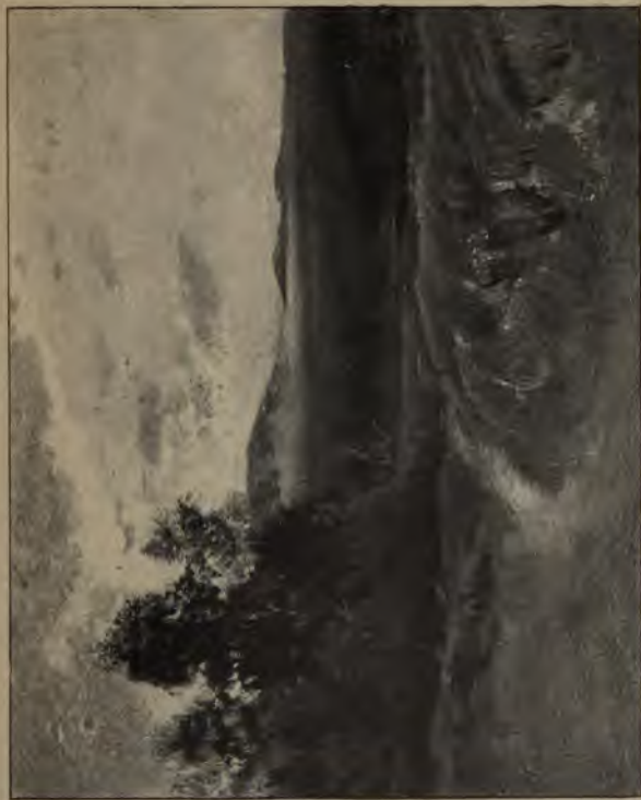
"HOW BRIGHT THE SUNSET GLORY LIES!" (Page 26.)